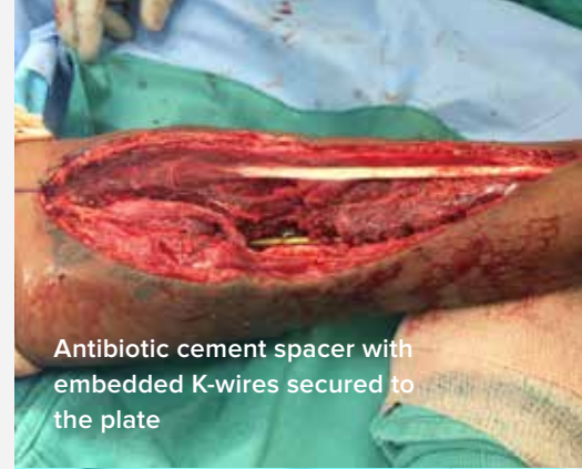
Antibiotic cement spacer with embedded K-wires secured to the plate

Ballistic injuries are often associated with a unique pattern of injury. The bony injury typically has a large area of comminution. There is always an associated soft tissue injury with a zone of injury that is often larger than anticipated by gross inspection. A careful physical examination and intra-operative evaluation of the wound is required to appropriately manage these complex injuries. In the digit, these injuries are often ideally treated with an external fixator. The Small Bone Fixator allows for access to the associated soft tissue injury for concomitant management. These ballistic injuries also typically result in a highly comminuted fracture pattern that limits the ability to perform open reduction and internal fixation. External fixation allows for consolidation of these fragments without the need for fragment-specific fixation. In cases where complete union is not achieved by this mode of fixation, revision of internal fixation is significantly easier because the large number of comminuted fragments consolidate and only one nonunion site remains.