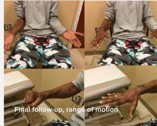
Final follow-up, range of motion