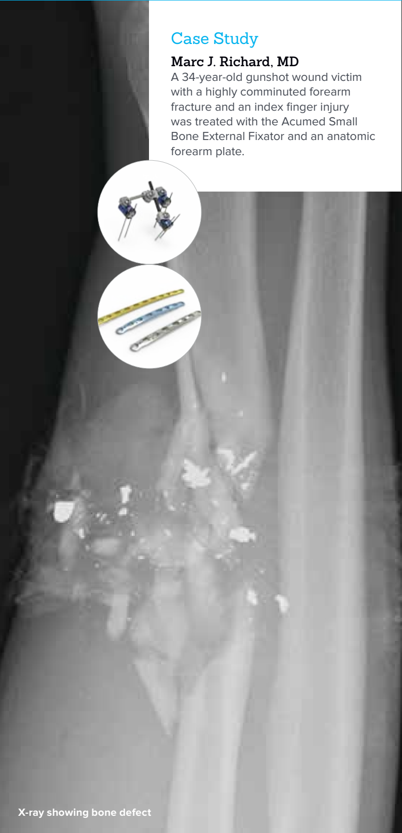
X-ray showing bone defect