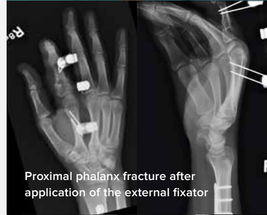
Proximal phalanx fracture after application of the external fixator