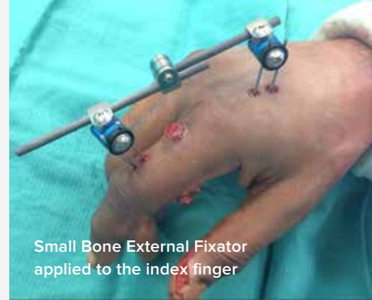
Small Bone External Fixator applied to the index finger